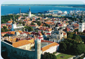
View from the Swissotel, conference venue

We have the pleasure to invite you to the Baltic Sea Region Programme Conference 2008!