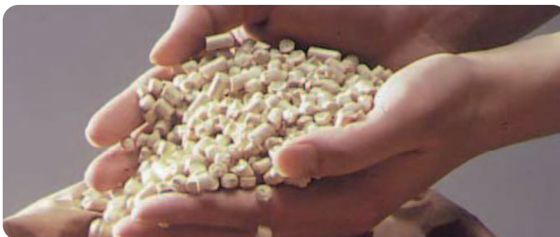
Pellet in the hand